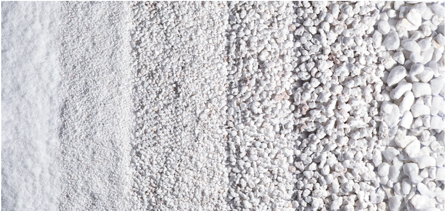
From the finest to the coarsest grades of perlite, Silbrico specializes in identifying, producing and delivering your specific needs.

For more information or to arrange for samples, please call: 800-323-4287 or email: info@silbrico.com